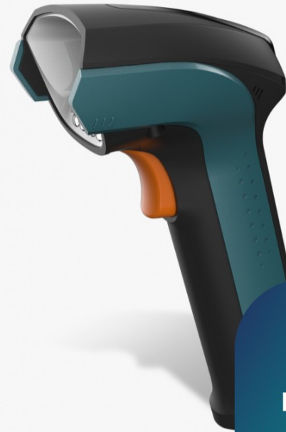
NVH220 Lophius Bluetooth Handheld Scanners